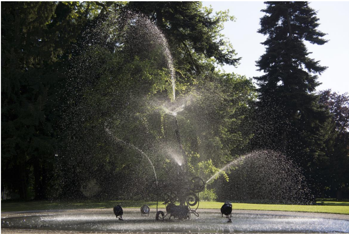
Jean Tinguely, Schwimmwasserplastik (1980) 407 x 214 x 184 cm, iron parts and wheels, water hoses, water jets, two electric motors, Museum Tinguely, Basel, donated by Paul Sacher

One highlight of the trip will be Tinguely's Schwimmwasserplastik (1980), the fountain that normally stands in Solitude Park in front of Museum Tinguely, but that for the duration of Museum Tinguely AHOY! is to be mounted on the deck of MS Evolutie. This fountain sculpture with its distinctive black drive wheels and five different waterspouts sprays water in several directions at once. Depending on which way the wind is blowing, viewers of this mechanical spraying spectacle risk getting sprinkled themselves. Tinguely wanted his fountain sculpture to spurt copiously to the four winds like a watery fireworks. Water's playfulness was something he was especially fond of. He used it to broaden the scope of his aura, some of which he fitted with waterspouts, just as he invested others with movement and/or sound and by doing so turned them into a multi-sensory experience.